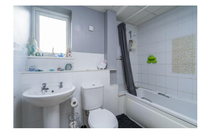
BATHROOM white suite comprising bath with electric shower over, wash hand basin, low level w.c., amtico floor, radiator, spot lights, double glazed frosted window.