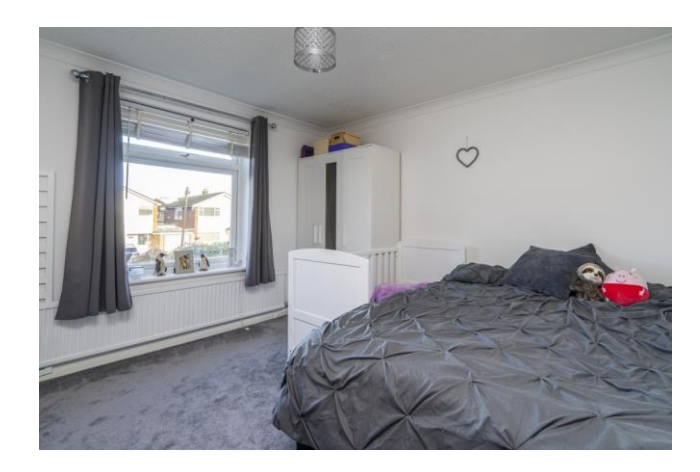
BEDROOM ONE with double glazed window, radiator.