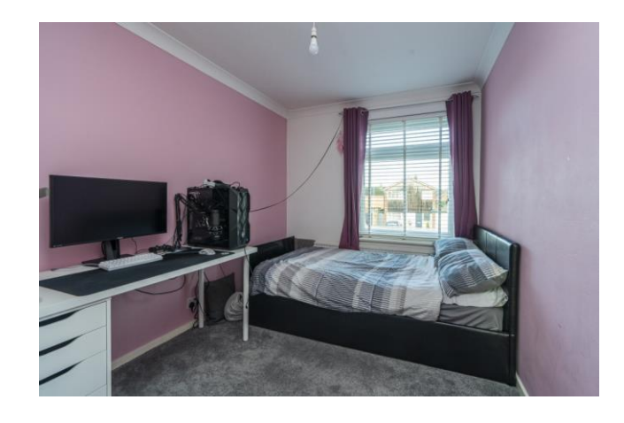
BEDROOM TWO with double glazed window, radiator.