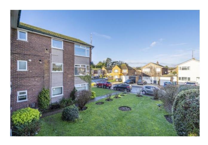
Surrounding Russell House are well kept lawned COMMUNAL GARDENS.